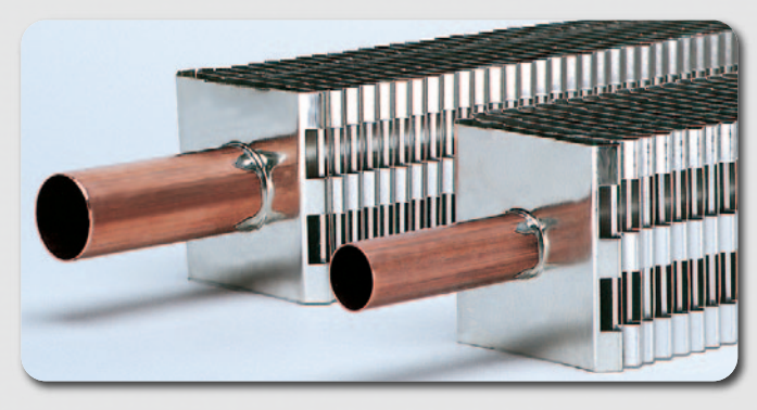
Choice of element size broadens range of applications.

Base/Line 2000 is manufactured with contractor-friendly features for quick, trouble free installation, without annoying callbacks. Each length of baseboard is fully assembled, ready for box-to-wall installation.